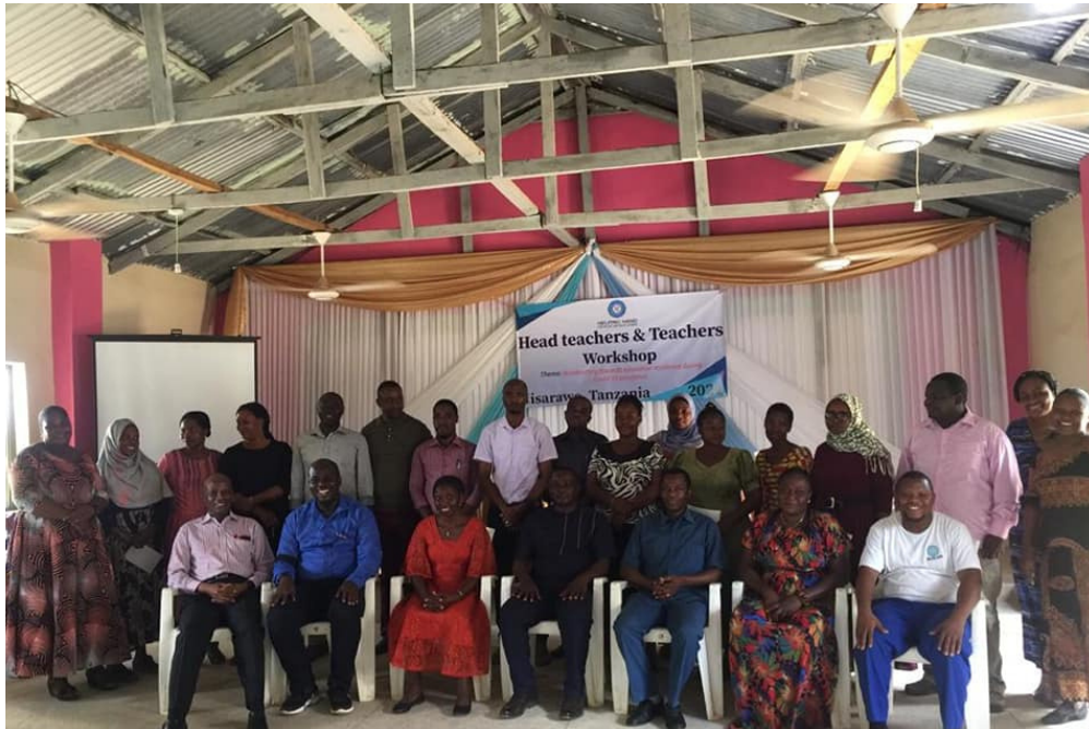
Headteachers & teacher`s Workshop in Tanzania