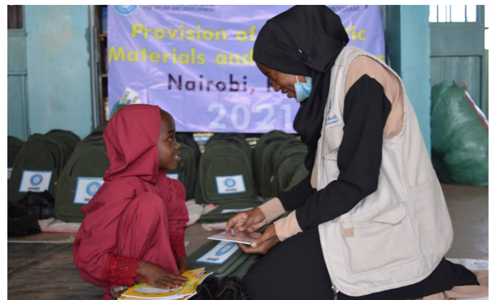
Scholastic materials, Nairobi, Kenya