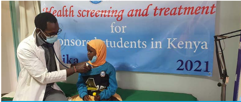
Health screening Thika, Kenya