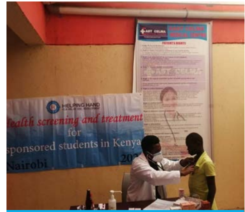
Health screening, Nairobi, Kenya