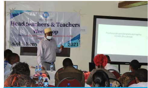
Headteachers & teachers Workshop Isiolo